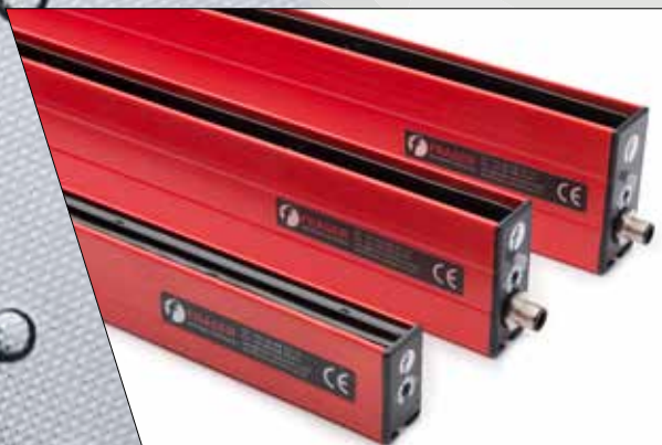
The NEOS Range