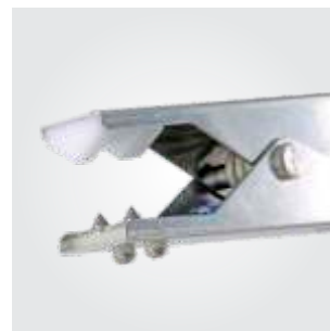
Tungsten Carbide Teeth