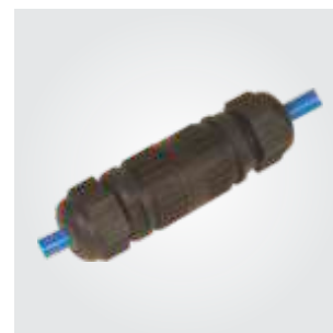
In Line Quick Connect.

The Bond Rite® EZ forms part of the Bond Rite® range of Static Grounding and Bonding Equipment available from Newson Gale Ltd