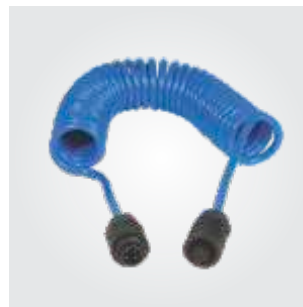
Cen-Stat cable supplied with male and female in line Quick Connects.

The spiral cable provides effective retractability when the clamp is not in use, ensuring the cable is neatly stowed and safely out of the way.