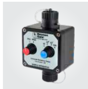
Universal Resistance Tester Product Code: URT.