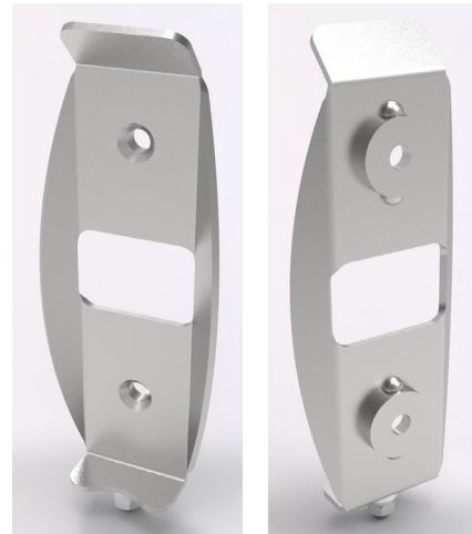
Magnetic Clamp Storage Point