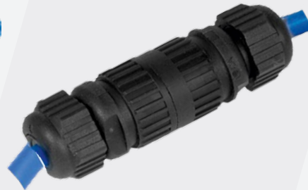
In-Line Quick Connect