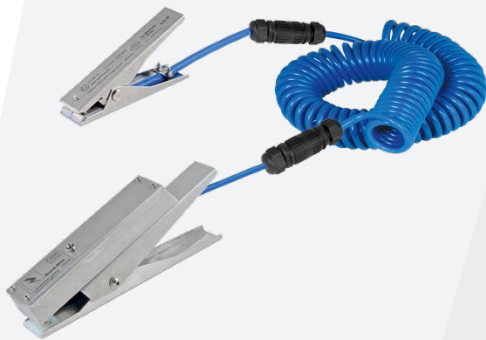
Bond-Rite EZ with large heavy duty clamp and 5m of Cen-Stat™ protected cable. Also available with standard size heavy duty clamp.