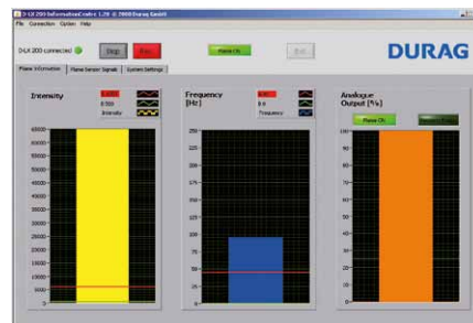
User interface of the flame monitor software

Flame properties and parameters of the flame monitor can be transmitted to a PC via a RS485 and an IrDA interface.