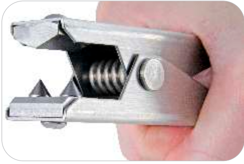
Tungsten Carbide Tips (Cen-Stat™ X45)

The 'Adhesives Test' proved the most challenging for all the clamps tested. A 1 mm layer of adhesive was applied to metal strips and all clamps failed at initial connection. When the clamps were then permitted some "jigging" by hand to dislodge the adhesive, the clamps that passed the coatings test, subsequently passed the adhesive test. Rusted and corroded clamps were also tested for values of resistance. These test results were alarmingly high, even on clean surface tests.