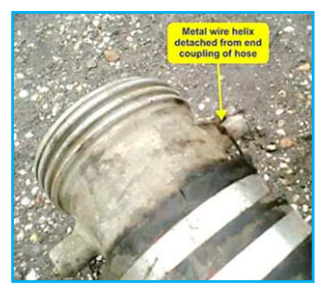
Figure 3 . An isolated coupling caused by a broken wire helix.

Newson Gale Nottingham, NG4 2JX, UK Tel: +44 (0)115 940 7500 Fax: +44 (0)115 940 7501 Email: groundit@newson-gale.co.uk