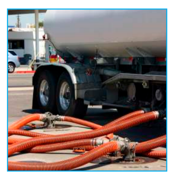
Figure 5: Tank truck loading underground tanks at a gasoline service station.

"Deliveries from road tankers to medium sized tanks are performed via flexible hoses using either gravity feed or pumps on the vehicle. Electrostatic ignition hazards may occur as a result of sparks from insulated conductors (e.g. hose couplings or the road tanker as a whole), brush discharges from nonconductive hoses or brush discharges within the receiving tank."