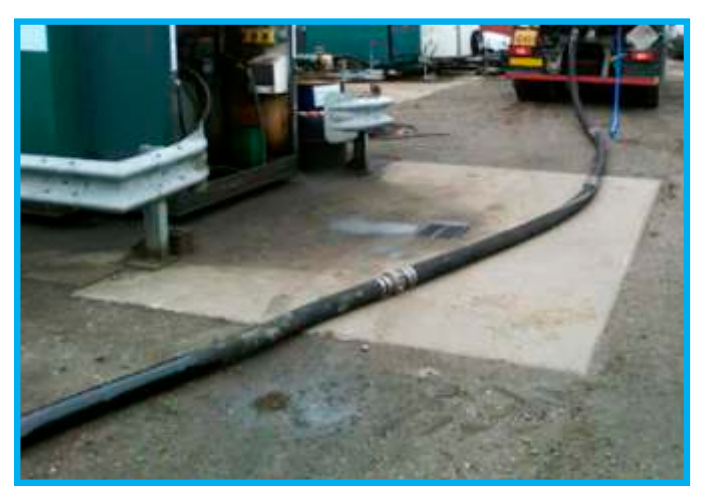
Figure 1. Four hose sections joined together in a vacuum tanker operation with an OhmGuard® hose tester testing the first hose section (blue cable).

There are normally three main reasons why discharges of static electricity from hoses can occur. One reason is that non-conductive hoses are used to transfer material. Non-conductive hoses are capable of accumulating and retaining high levels of static charge which can result in incendive brush discharges from the hose itself, or the charging of isolated conductive objects attached to the hose like a nozzle or coupling that can discharge a spark themselves. It is generally